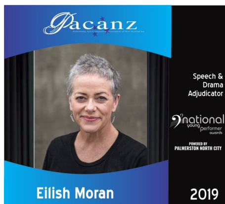
Speech & Drama Adjudicator