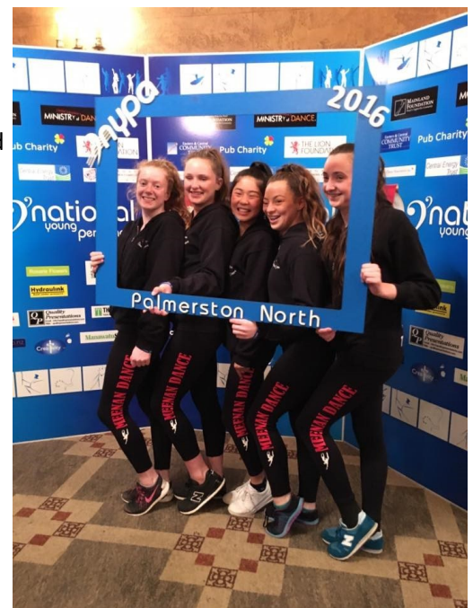
2016 Troupe Meenan Dance having their moment with the “Fame Frame”