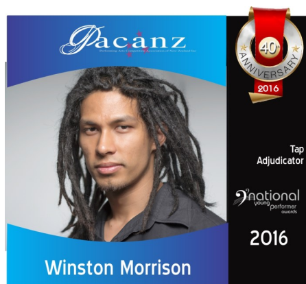
Tap Dance Co-Adjudicator