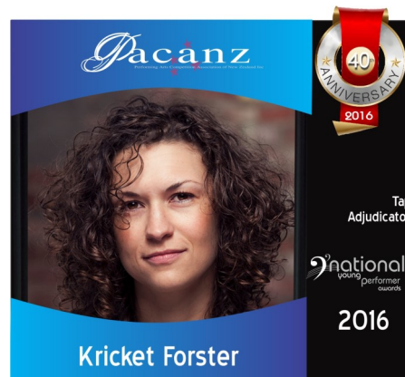
Tap Dance Co-Adjudicator